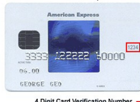
4 Digit Card Verification Number