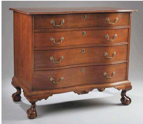
Lot 303. An American Chippendale Birch Oxbow Chest of Drawers, ca. 1770-1790, Salem, MA, $38,200