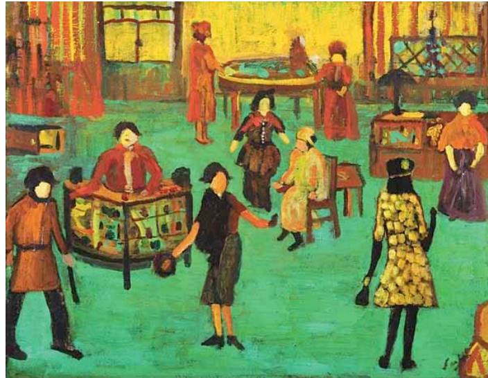
Lot 660. Marion Souchon, The Shoplifter, oil on canvas, 21 ½ by 27 ½ in., $14,400 RECORD PRICE FOR THE ARTIST

Lot 660, Marion Sims Souchon's (American/Louisiana, 1870-1954) oil "The Shoplifter" also performed impressively, achieving a record price for the artist at auction with $14,400.