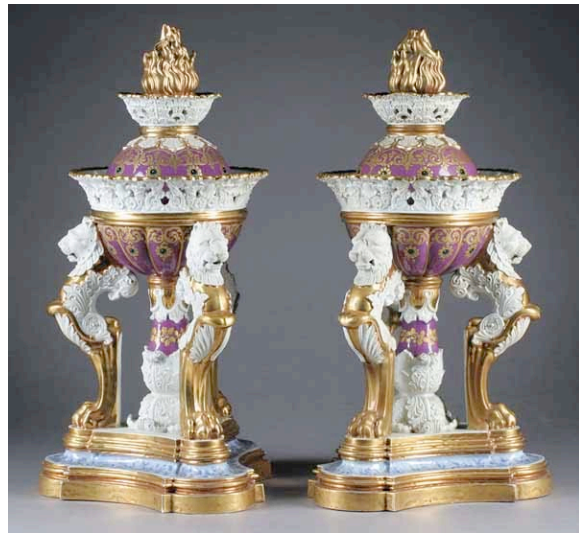
Lot 510. A Mid-19 th C. Pair of Large Paris Porcelain White, Imperial Purple and Gilt Pot-Pourri Vases, by Jacob Petit, $14,700

For more information about a specific lot, please contact the Consignments Department at +1 504.899.5329 or visit Neal Auction Company's website at www.nealauction.com to view their online catalogue.