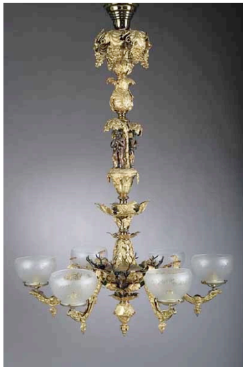
Lot 149. A mid-19 th C. American Ormolu and Patinated Six-Light Gasolier, $22,900

Lots 148 and 149 , a matching pair of American Ormolu and Patinated Metal Six-Light Gasoliers sold for $22,300 and $22,900 respectively, while a large pair of Jacob Petit Pot-Pourri Vases , lot 510 , also sold very well at $14,700. Highly attractive Nesle, Inc. lighting fixtures are worth mention, as they hammered in at six times their presale estimates. Lots 229 and 230 , Pairs of Regency-Style Two-Light Sconces , with silvered brass scroll arms and shell-form wooden back plates, estimated at $500-$750, each sold for $3,055.