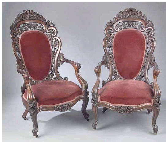
Lot 452. A Pair of American Rococo Laminated and Carved Rosewood Armchairs, attributed to John Henry Belter, New York, $55,800

Neal Auction Company's Belter and Meeks offerings also performed commendably, with an exceptional pair of Belter armchairs reaching a world record price. Lot 451 , A mid-19 th C. Rococo Carved Rosewood Meridienne , attributed to John Henry Belter, sold very well at $17,600 while lot 452 , its companion, a Pair of American Rococo Laminated and Carved Rosewood Armchairs , achieved the record-setting price of $55,800. The following lot, number 453 , a single Parlor Chair with the same Belter attribution, realized a respectable $9,400. J. & J.W. Meeks Makers, New York , received strong interest as well, with lot 456 , a ca. 1835 Rosewood Secretary Bookcase selling for $12,300.