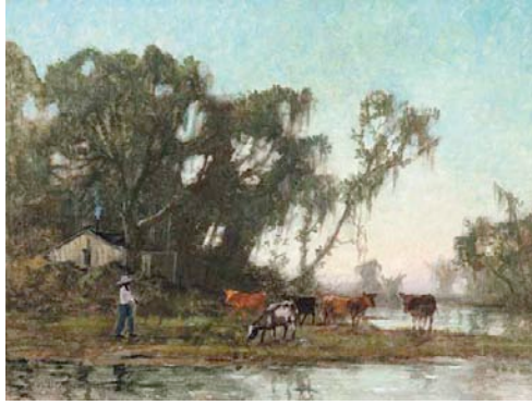
Lot 615. Knute Heldner, Black Man Herding Cattle, 12 by 15 ¼ in., $18,000

Another record at auction was an impressive Ida Kohlmeyer (American/New Orleans, 1912-1997) abstract oil titled “Fantasy, No. 2” ( lot 652 ) which achieved $25,900.