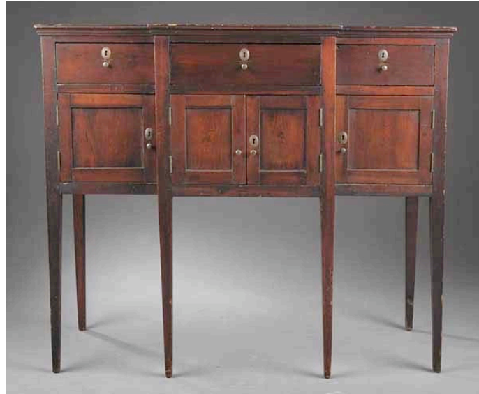
Lot 310. A Southern Walnut, Pine and Poplar Huntboard in the Hepplewhite Taste, ca. 1800, North Carolina, $21,100

estimate of $8,000-$12,000, lot 310 , a ca. 1800 Southern Huntboard in the Hepplewhite Taste sold for $21,100. And finally, worth noting was lot 347 , a late 18 th /early 19 th century Louisiana Walnut Petite Armoire which achieved $21,100.