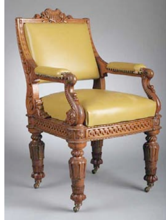
Lot 443. A Rare American Carved Oak House of Representatives Armchair, mid 19 th c., attributed to Bembe & Kimmel, New York, $18,800 RECORD PRICE

Neal Auction Company's Belter and Meeks offerings also performed commendably, with an exceptional pair of Belter armchairs reaching a world record price. Lot 451 , A mid-19 th C. Rococo Carved Rosewood Meridienne , attributed to John Henry Belter, sold very well at $17,600 while lot 452 , its companion, a Pair of American Rococo Laminated and Carved Rosewood Armchairs , achieved the record-setting price of $55,800. The following lot, number 453 , a single Parlor Chair with the same Belter attribution, realized a respectable $9,400. J. & J.W. Meeks Makers, New York , received strong interest as well, with lot 456 , a ca. 1835 Rosewood Secretary Bookcase selling for $12,300.