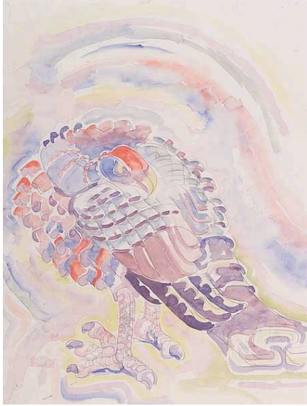
Lot 631. Walter Inglis Anderson, Gobbler: Oldfields Series, watercolor, 25 by 19 in., $47,000