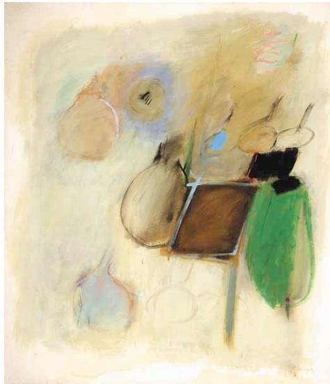
Lot 652. Ida Rittenberg Kohlmeyer, Fantasy, No. 2, 58 by 58 ½ in., $25,900 RECORD PRICE FOR THE ARTIST

Another record at auction was an impressive Ida Kohlmeyer (American/New Orleans, 1912-1997) abstract oil titled “Fantasy, No. 2” ( lot 652 ) which achieved $25,900.