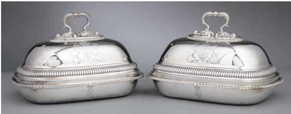
Lot 215. A Fine Pair of George III Royal Sterling Silver Poultry Dishes and Covers, by Richard Cooke, London, ca. 1806, $38,800

LeBlanc challenged the room: "Find another pair!"