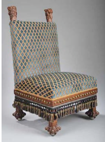
Lot 153. An Important American Art Furniture Carved Mahogany Upholstered Chair, attributed to Louis Comfort Tiffany/Associated Artists, New York, ca. 1880, $50,500

Selling remarkably well at ten times its low presale estimate was lot 153 , an American Art Furniture Chair attributed to Louis Comfort Tiffany , circa 1880, which realized an admirable $50,500. And against a presale estimate of $4,000-$6,000, lot 443 , a mid-19 th century American Carved Oak House of Representatives Armchair attributed to Bembe & Kimmel beat all previous record prices, selling for $18,800.