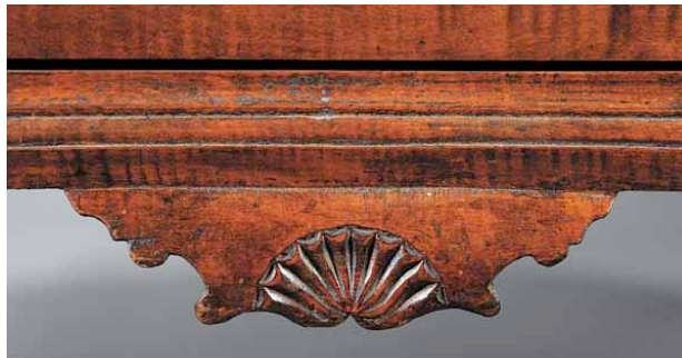
Lot 364 Detail

Neal Auction Company's December 2 and 3 Holiday Estates Auction featured many important examples of American furniture from the early 18 th to early 19 th centuries.